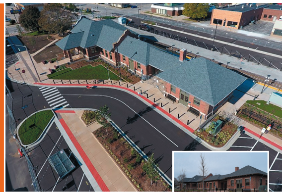
APWA Project of the Year 2018 – Historic Restoration/Preservation of Lincoln Depot

Sessions Focus on Innovations and Improvements in Public Works