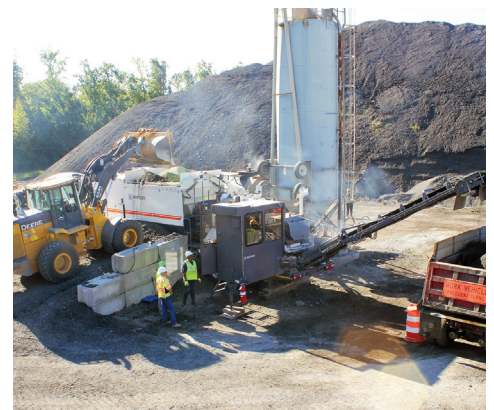
2018 reconstruction, millings from existing pavement are cold central plant-recycled using foamed asphalt process in Wirtgen KMA 220i, and stockpiled for replacement as base course. Along with full-depth recycling (FDR), intensive asphalt pavement recycling will save millions over three-year course of project

And for more on CCPR in the context of pavement preservation, visit the new web site of the Pavement Preservation & Recycling Alliance (PPRA) at www.roadresource.org